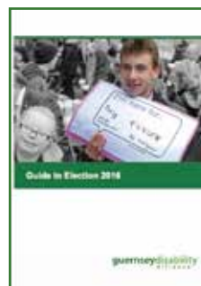
Guide to Election 2016