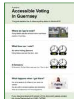
Accessible Voting In Guernsey

This month's GDA meeting, monthly newsletter and printing is kindly sponsored by Donate.