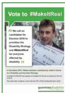
Guernsey Disability Alliance Manifesto